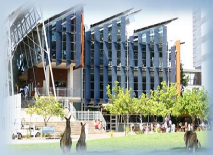
Sunshine Coast University