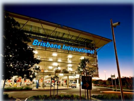
Brisbane International Airport