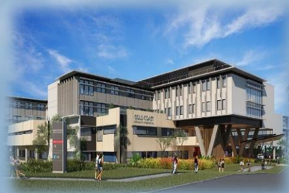
Gold Coast Private Hospital