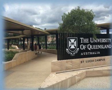
UQ Gordon Greenwood Building