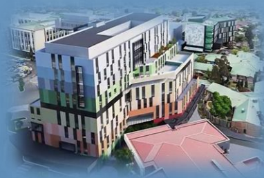
Joan Kirner Hospital